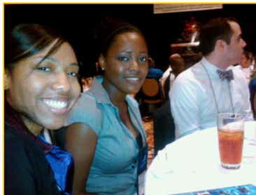
Students pose for a photo during a luncheon featuring a speech by Congresswoman Sheila Jackson Lee.