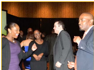
NOBCChE Terps enjoying the Award Ceremony gala on the dance floor.