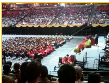
UMD College of Chemical & Life Sciences Commencement on May 19, 2011. The class of 2011 was the last class to graduate from our former school, CLFS. See recent graduates to the left.