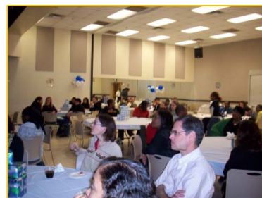
A glimpse of the crowd at the beginning of the celebration.