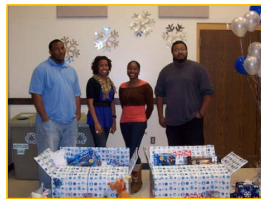
2010-2011 Executive Board members at the celebration on December 10, 2010.

To cap off a great semester and say thank-you to all of those who supported the UMD chapter of NOBCChE during our Professional Development Seminar Series, a celebration was held! There was only one catch – admission to the party was not free! Each person had to bring one unopened toy to donate to Toys for Tots. Even executive board members were required to participate in the fundraiser to be a part of the celebration. Faculty and students from Chemistry, Biochemistry, and Engineering were all invited to come out to the party and socialize with people who they may not see on a regular basis. Along with the faculty and students, their spouses and family members were also invited to celebrate. This proved to be key to the success of the party as a large crowd showed up to gathering. The diversity of people and interests made for a great networking atmosphere. People from different disciplines united to talk about their common interests. The crowd was also entertained with buffet style food and drinks catered by Gist Family Catering, inviting background music, and a surprise iTunes gift card giveaway!