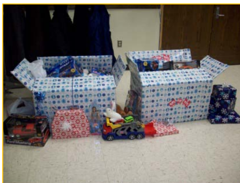
Toys collected for the Toys for Tots Toy Drive during the celebration. Thank you for all your donations!