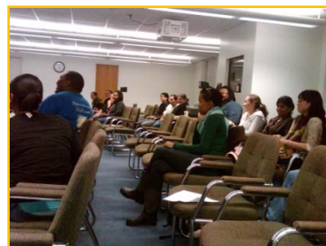
NOBCChE general body meeting featuring the professional development topic of "Women in Science"