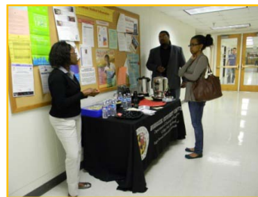
NOBCChE members preparing for a successful general body meeting.