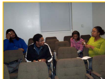
Students work as a team during a general body meeting!