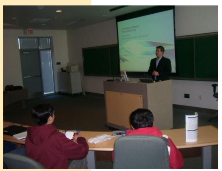
PGCPS students take part in a session at Tech Mania.

Fourth-grade students stay after school two days a week to tutor their peers. The student tutors are highly trained and follow a structured lesson framework, which helps them to develop mentoring, leadership, and interpersonal organizational skills.