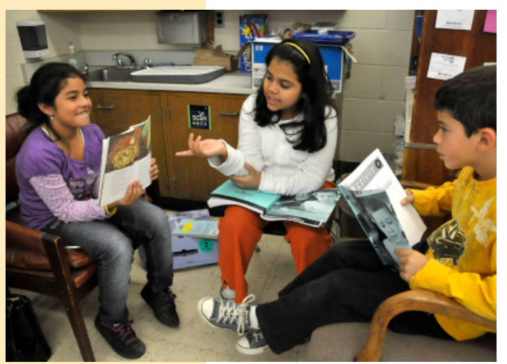
Fourth-graders at Calverton Elementary School tutor their peers in reading.