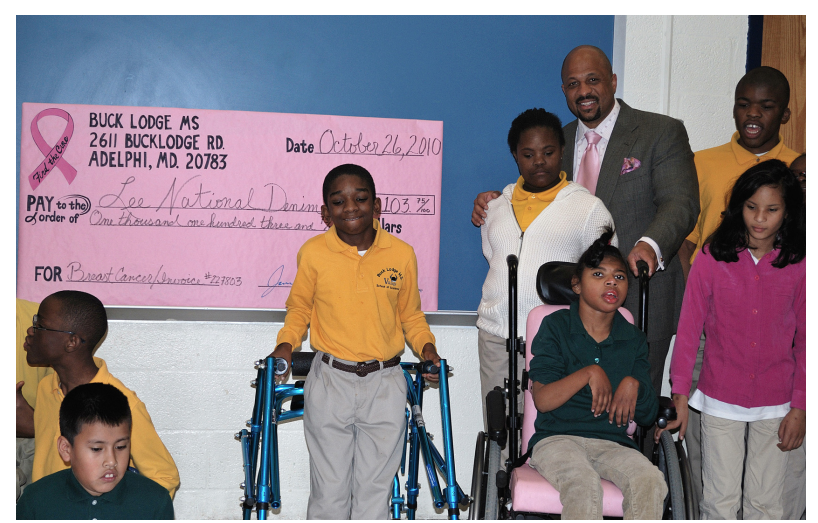
Buck Lodge Middle School students proudly stand by the 'big check' they are donating to support breast cancer research.

Buck Lodge Middle School students raised $1,104 for breast cancer through their participation in the nationally-celebrated Lee National Denim Day. Lee National Denim Day adheres to a simple philosophy: one day, one cause, one cure. It is one of the largest single-day fundraisers nationwide for breast cancer.